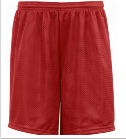
MEN'S TRICOT MESH SHORTS